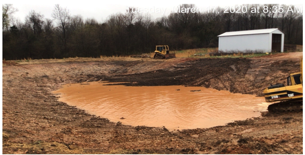
Photograph 30: Removal of solid waste from Pond 1 continued. Additional rainfall resulted in additional liquid waste in Pond 1.