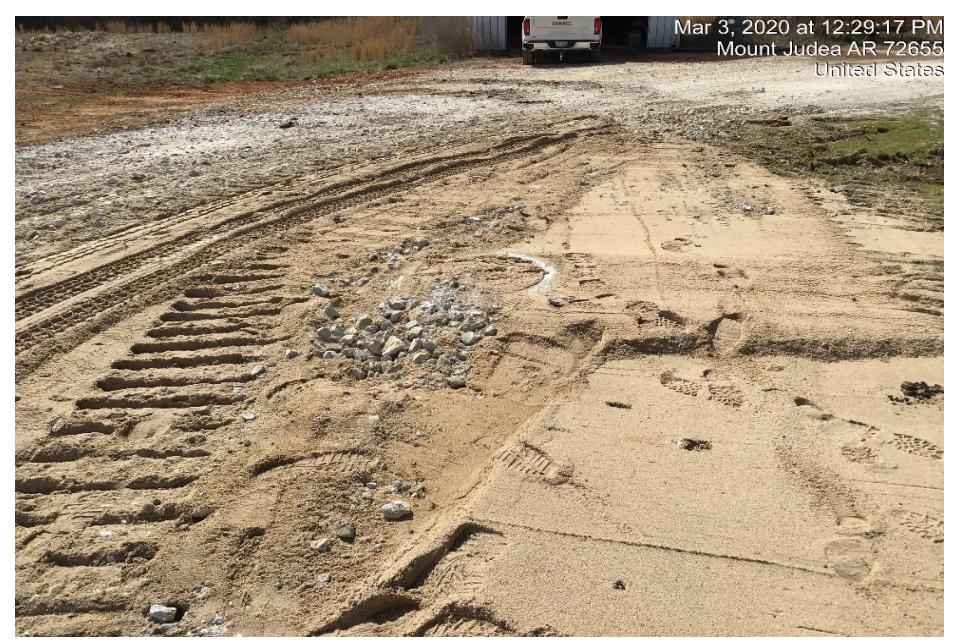
Photograph 23: Manhole filled with sand.