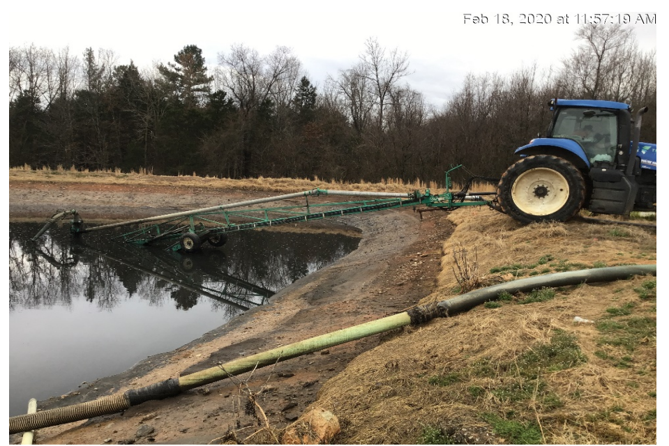
Photograph 13: Pumping of liquid waste from Pond 1 continued.