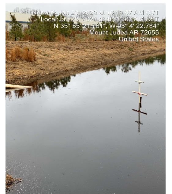
Photograph 1: Water level of Pond 1 prior to start of work.