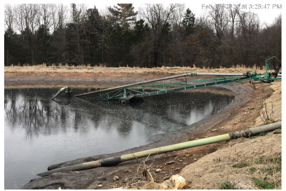
Photograph 12: Pumping of liquid waste from Pond 1 continued.

Photograph 11: Removal of liquid waste from Pond 1 continued.