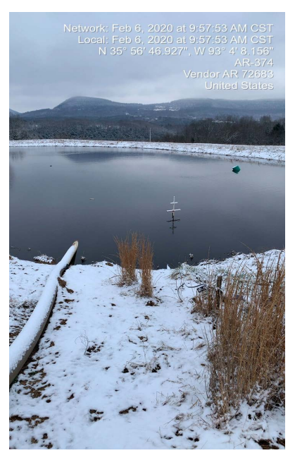
Photograph 8: Water level in Pond 2.