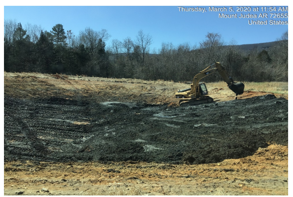
Photograph 26: Solid waste is removed from from Pond 1.