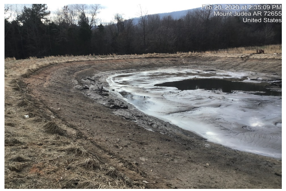
Photograph 14: Solid waste remains in Pond 1 after liquid waste is removed.