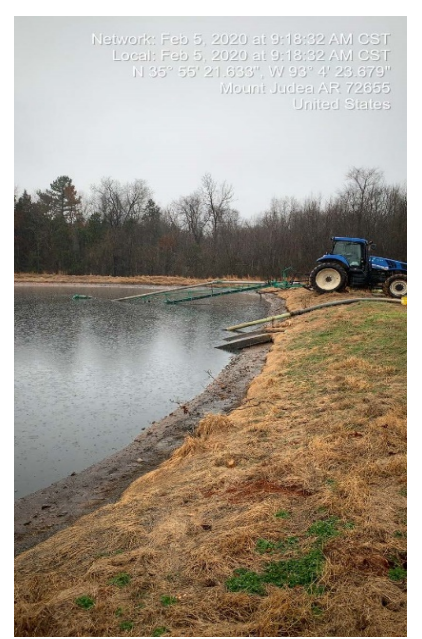
Photograph 7: Removal of liquid waste from Pond 1 continued.