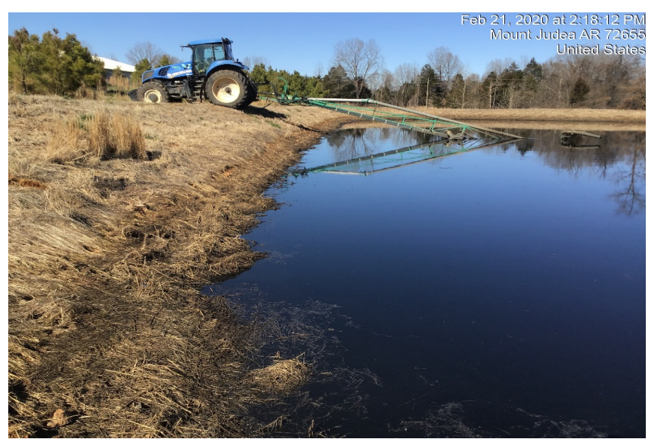
Photograph 15: Removal of liquid waste from Pond 2 started.