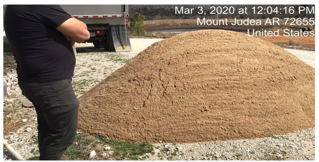
Photograph 22: Manhole was filled with sand.