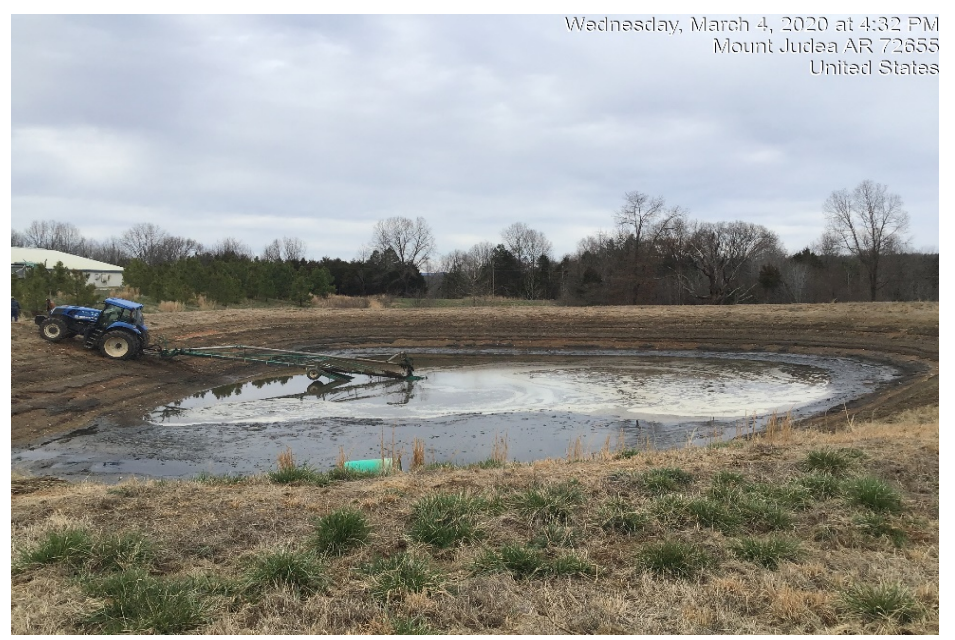
Photograph 24: Removal of liquid waste from Pond 2 continued.