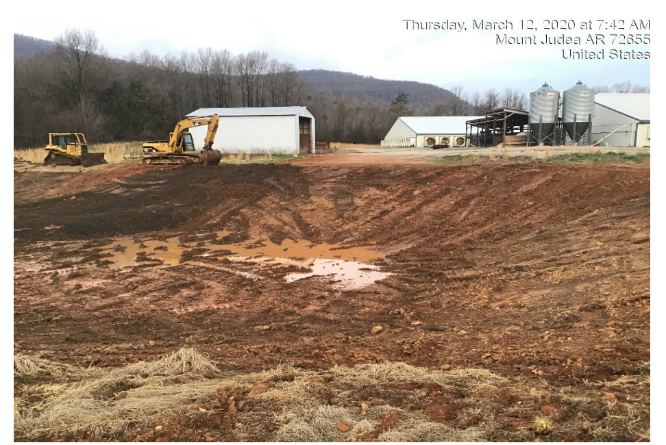
Photograph 29: Removal of solid waste from Pond 1 continued.