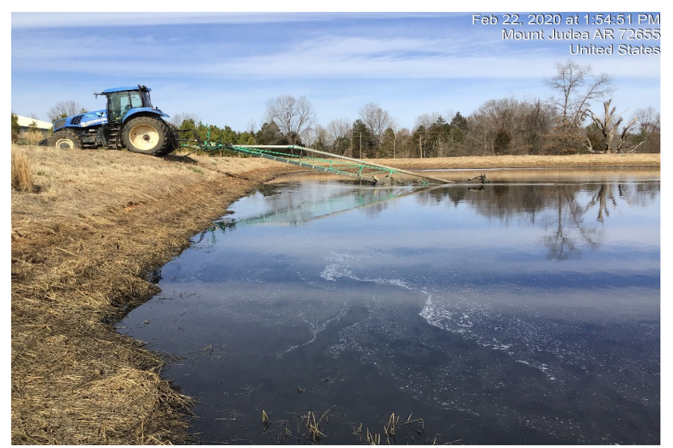
Photograph 16: Removal of liquid waste from Pond 2 continued.