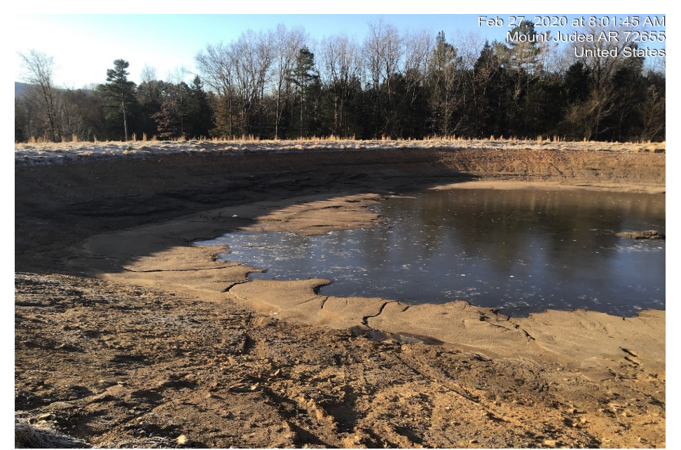
Photograph 17: Pond 1 nearly all liquid waste removed, solid waste remaining. Rainfall resulted in more liquid waste to be removed.