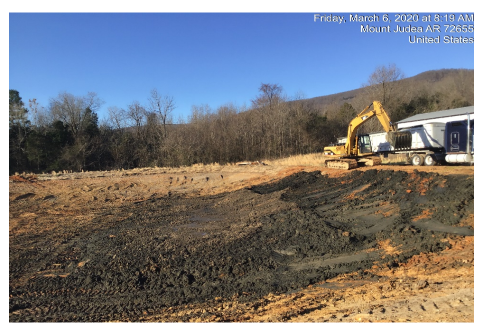
Photograph 27: Removal of solid waste from Pond 1 continued.