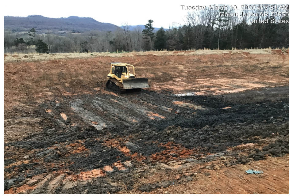
Photograph 28: Removal of solid waste from Pond 1 continued.