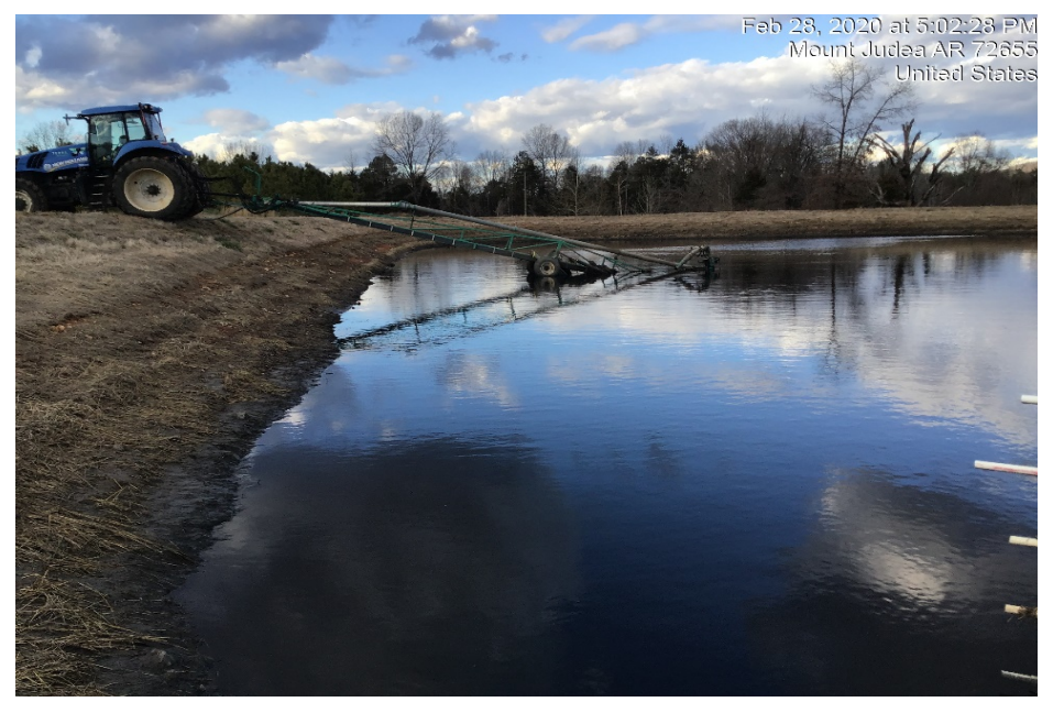
Photograph 18: Removal of liquid waste from Pond 2 continued.