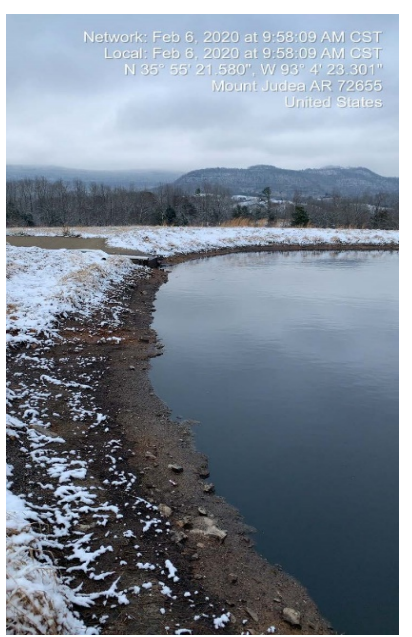
Photograph 9: Water level in Pond 1.