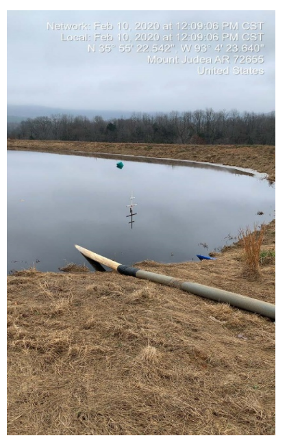
Photograph 10: Water level in Pond 2.