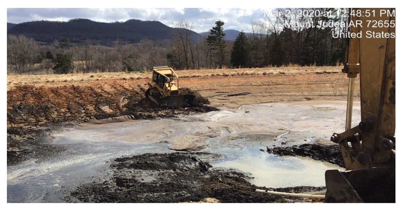
Photograph 21: Solid waste in Pond 1 being pushed toward excavator so it may be loaded into dump trailers and transported to a landfill.