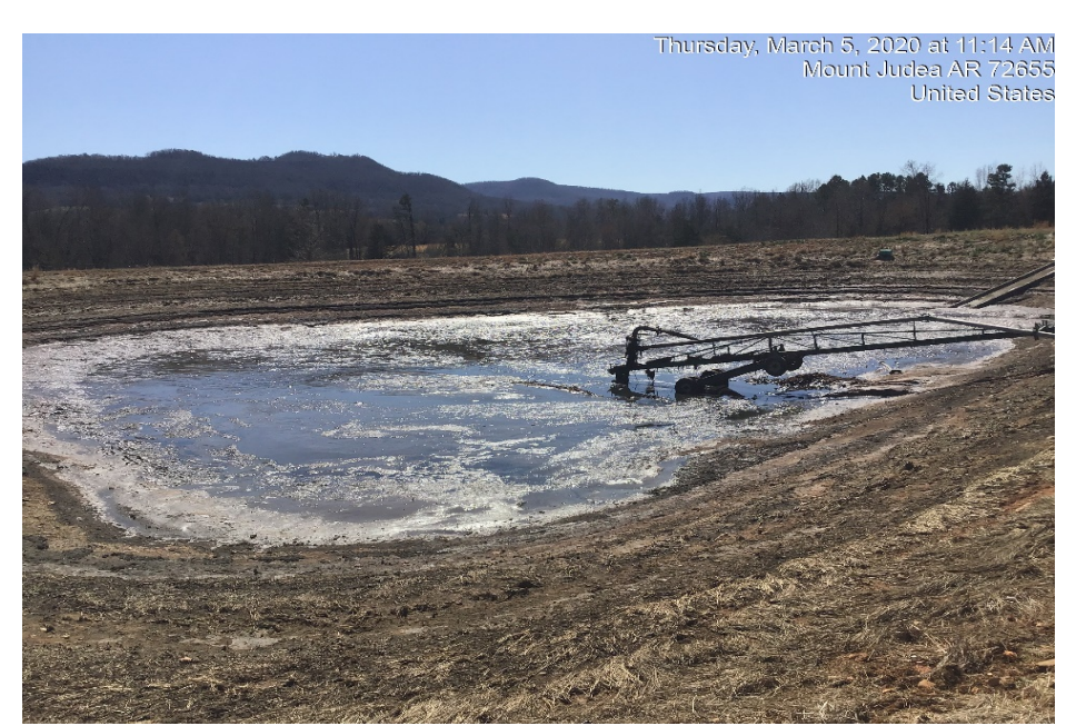
Photograph 25: Removal of liquid waste from Pond 2 continued.