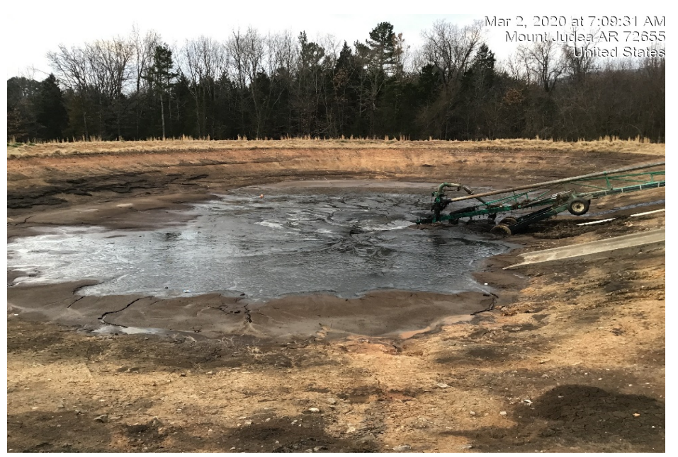
Photograph 20: Pond 1 with nearly all liquid waste removed.