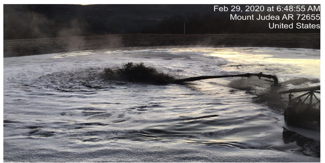
Photograph 19: Mixing of Pond 2.