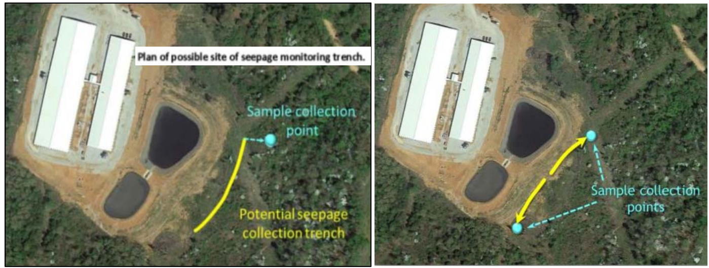
Figure 3. Photos showing (left) the site of the seepage monitoring trench near the swine waste holding ponds, and (right) the "north" and "south" sample collection points. From the July 1 to September 30,

* Water quality in the north and south ends of a long trench ("Interceptor Trench 1 [South], Interceptor Trench 2 [North]") near the swine waste holding ponds which, the BCRET team stated (July – Sept. 2014 quarterly progress report, p.2), was installed to monitor potential leakage. The trench samples are confusingly labeled as indicated above, implying that there are two trenches when instead there is one trench that is being sampled at each end. The trench location is shown in Figure 3 below; the holding ponds are shown and described in Figure 4. The water quality data for the trench are summarized in Table 7 below.